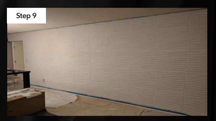
Let Oil based primer completely dry before next step