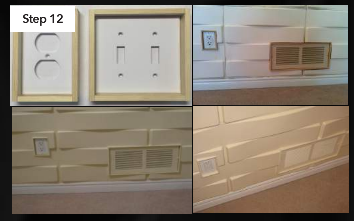
We sell frames for outlets, switches or vents