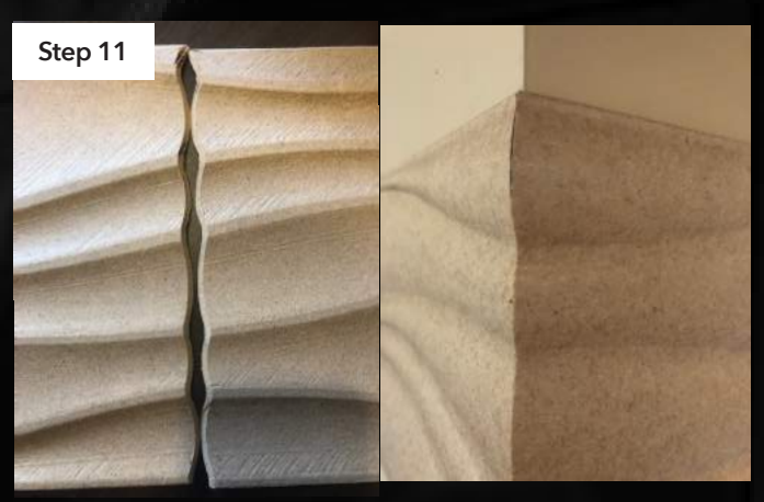
Mitre panels for corner applications