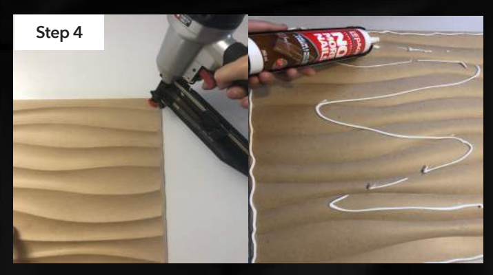
Apply construction adhesive along the sides and middle areas. Using a nail gun is optional but secures panels flat.