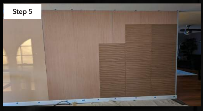
Install each panel as per your starting point