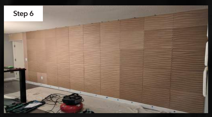
Using a nail gun is optional but helps maintain panels flat against the surface