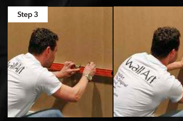
Measure and mark your starting points