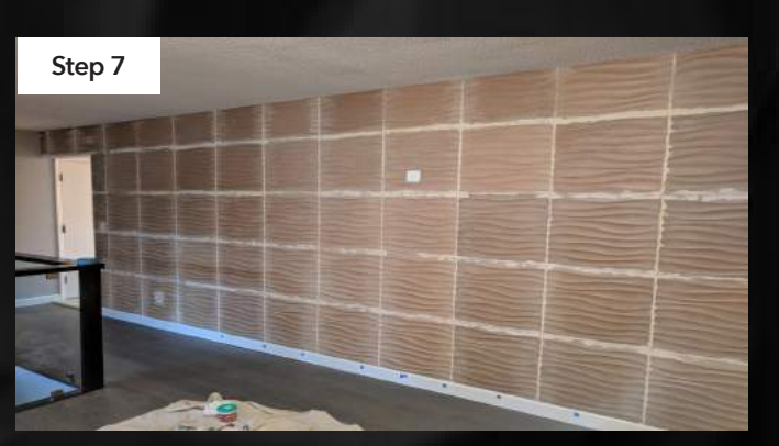
Apply paintable wood filler or caulking along the seams