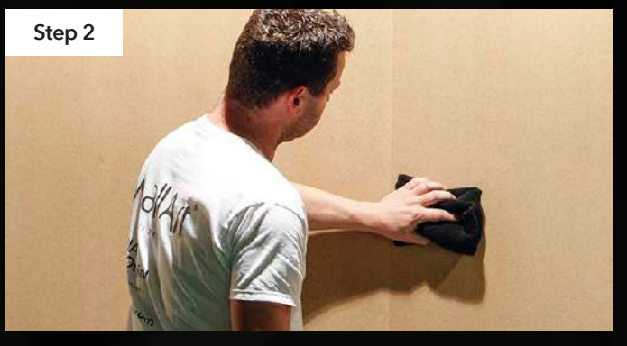
Wipe walls of any dust & fix any paint peeling