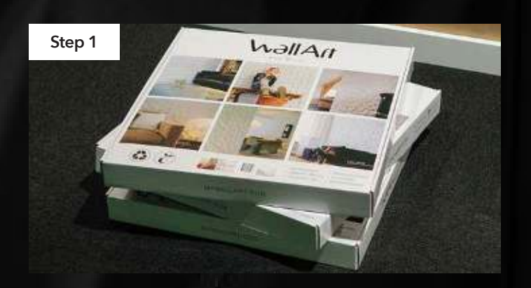
Let your panels acclimate for 24 hours