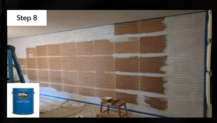
Apply a coat of Oil based primer & sealer